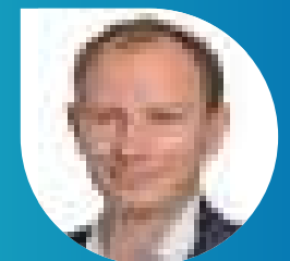
Ondřej Knotek Member of the European Parliament

Europe needs proactive industries to accelerate a pragmatic transition towards sustainability and a circular economy. VinylPlus has been proactive in phasing out additives of concern, surpassing regulatory standards, and seeking to ensure the safety of the additives utilised. I commend VinylPlus for setting an example with the positive approach it has taken to advance towards a circular and carbon-free economy.