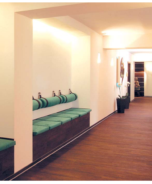
The flexible flooring material was also used to cover the comfortable benches